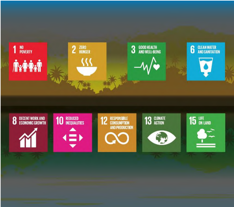
Figure 2 - Impacts of deforestation on Sustainable Development Goals