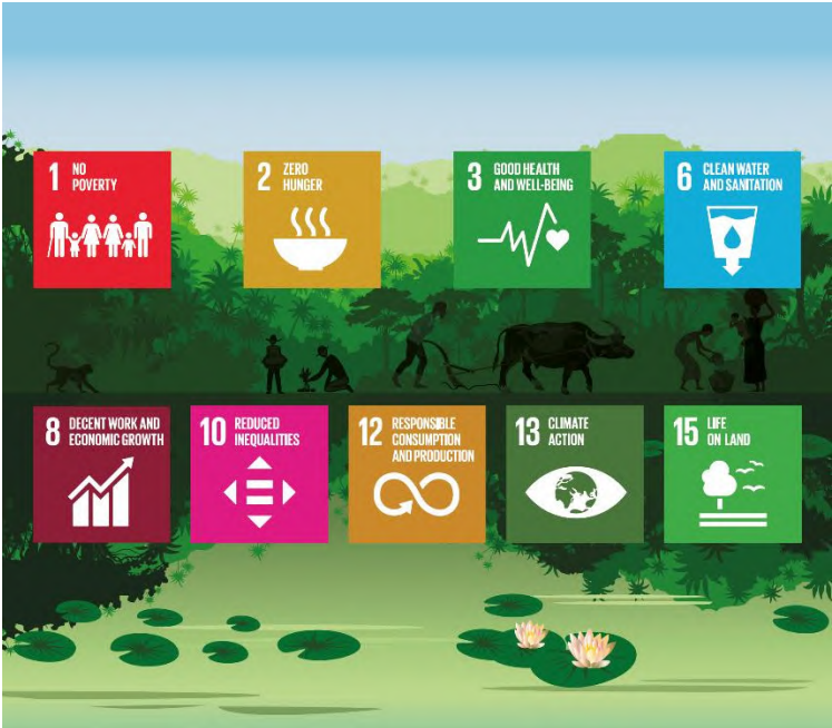
Figure 1 - Forest goods and services supporting the UN Sustainable Development Goals

Further EU measures to protect forests would be consistent with international agreements and commitments, which fully acknowledge the need for ambitious action to reverse the trend of deforestation. The Paris Agreement on Climate Change and the Global Strategic Plan for Biodiversity 2011-2020 adopted under the UN Convention on Biological Diversity and the Aichi Biodiversity Targets promote sustainable forest management, protection and restoration efforts xiv . Reducing forest loss and degradation is a priority under the UN Strategic Plan on Forests xv . Strengthening efforts to manage forests sustainably is also central to the UN 2030 Agenda for Sustainable Development as forests play a multifunctional role that supports the achievement of most Sustainable Development Goals.