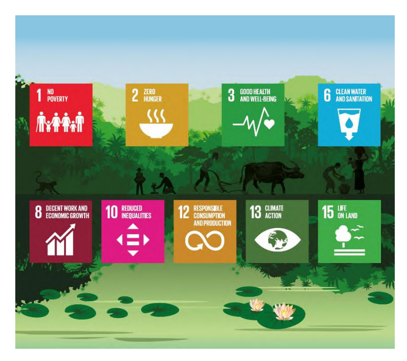
Figure 1 - Forest goods and services supporting the UN Sustainable Development Goals

Further EU measures to protect forests would be consistent with international agreements and commitments, which fully acknowledge the need for ambitious action to reverse the trend of deforestation. The Paris Agreement on Climate Change and the Global Strategic Plan for Biodiversity 2011-2020 adopted under the UN Convention on Biological Diversity and the Aichi Biodiversity Targets promote sustainable forest management, protection and restoration efforts<sup>14</sup>. Reducing forest loss and degradation is a priority under the UN Strategic Plan on Forests<sup>15</sup>. Strengthening efforts to manage forests sustainably is also central to the UN 2030 Agenda for Sustainable Development as forests play a multifunctional role that supports the achievement of most Sustainable Development Goals.