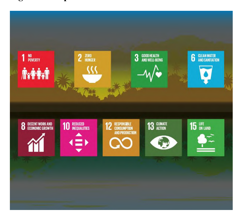
Figure 2 - Impacts of deforestation on Sustainable Development Goals